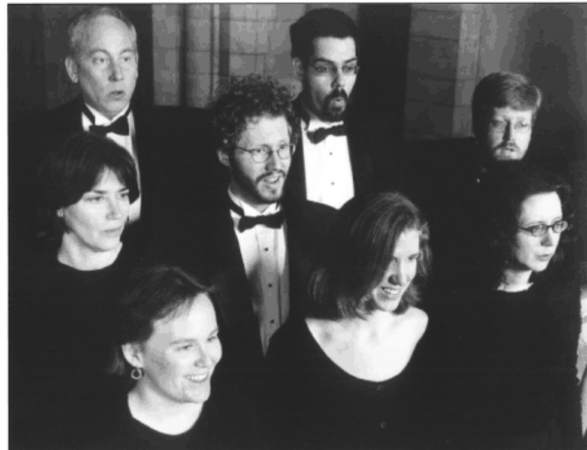
Some members of the Hyde Park-based Chicago Chorale.